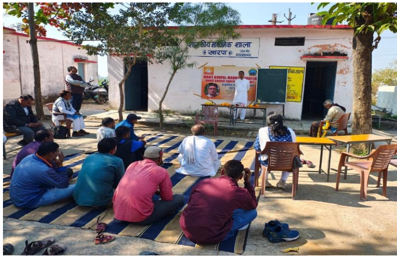
UNNAT BHARAT ABHIYAN CELL MANIT-BHOPAL